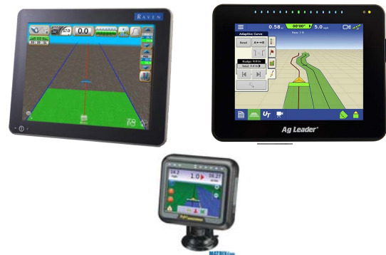
Variable rate, straight rate and GPS guidance accessories